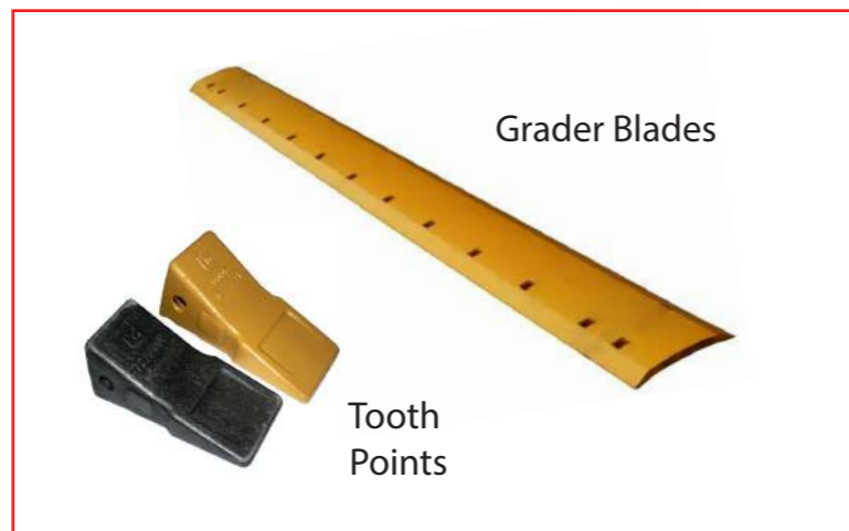
Earth Moving Parts