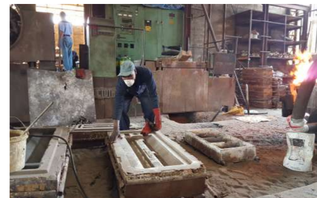
STEP 3. Mould Shop Making the sand mould with the pattern in step 2 and a special sand mixture.