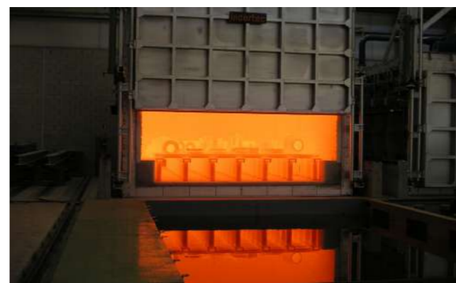
STEP 5. Heat Treatment The part is heat treated to obtain the required hardness level.