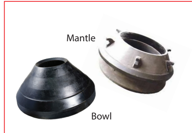
Cone Crusher Parts