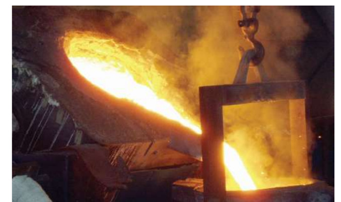
STEP 4. Melting Shop Scrap steel is melted up to 1640° C and given the required chemical composition by adding alloying elements.