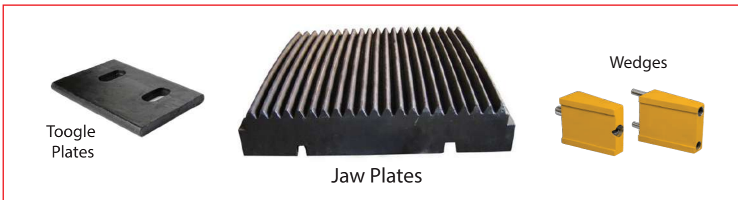
Jaw Crusher Parts