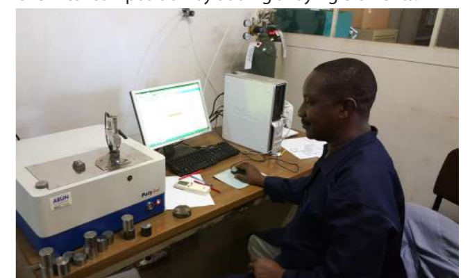
STEP 6. Quality Control We check the dimensions, chemical composition, and hardness to ensure quality.