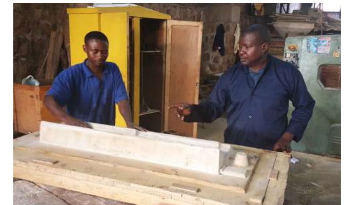
STEP 2. Pattern Shop Making a model of the part in wood to imprint into the sand mould.